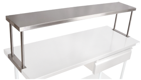
OS-ES-1248 (Does Not Include Table)