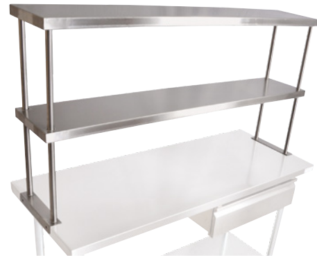
OS-ED-1248 (Does Not Include Table)

DOUBLE OVER SHELF WITH ADJUSTABLE MID SHELF